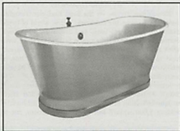
Mercer nickel polished tub